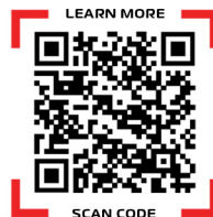
RIPPER BEDDER TILLAGE TOOL

The Ripper-Stripper® tillage tool is the most customizable strip-till machine available. Choose from a lead coulter that clears a path for the shank or a cover crop roller with an 11" diameter drum that crimps and deflects residue away from the row. The deep-till shanks with shark-fin points and wear bars rip through compaction from 9" to 18" deep. Plus, you can choose from the widest variety of attachments to complete the tillage pass.